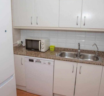
This first floor, 2 bedroom, 2 bathroom apartment is ideally located for both beach and golf

You enter this modern apartment into a large, light, beautifully furnished open plan lounge/dining area. Patio doors open out onto the terrace with garden, mountain and sea views